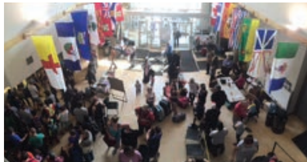
← Albion village filled with evacuees