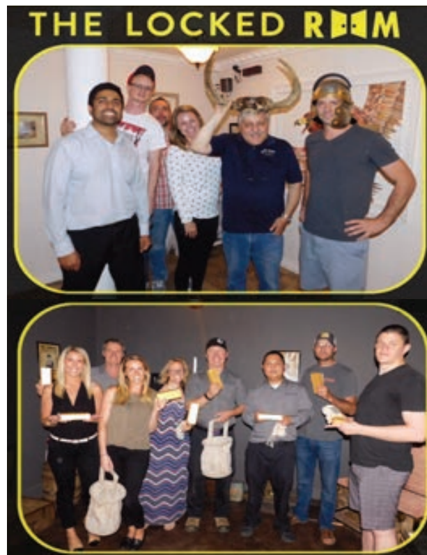
← The Calgary group at their teambuilding exercise "the Locked Room"